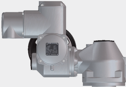
Mounting position A