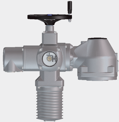
Mounting position B 1)